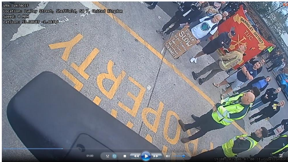
Image 3: Screenshot of Dashcam Footage on 19 August 2025 at 06:47:00.

(D) As the driver of the first RCV then inched forwards so that the RCV was very close to the yellow property line, the individuals directly in front of the RCV moved to the side of the RCV (see the CCTV Footage [DAF1/14] and the Dashcam Footage [DAF1/17] at 06:47:00 to 06:49:00 and image 4 [DAF1/19] and image 5 [DAF1/20] below).