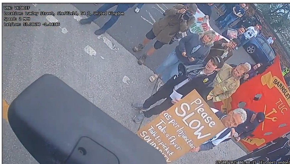
Image 4: Screenshot of Dashcam Footage on 19 August 2025 at 06:48:15.

(D) As the driver of the first RCV then inched forwards so that the RCV was very close to the yellow property line, the individuals directly in front of the RCV moved to the side of the RCV (see the CCTV Footage [DAF1/14] and the Dashcam Footage [DAF1/17] at 06:47:00 to 06:49:00 and image 4 [DAF1/19] and image 5 [DAF1/20] below).