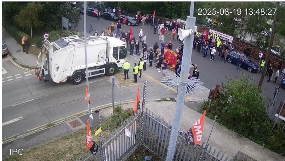
Image 5: Screenshot of CCTV Footage on 19 August 2025 at 06:48:27.