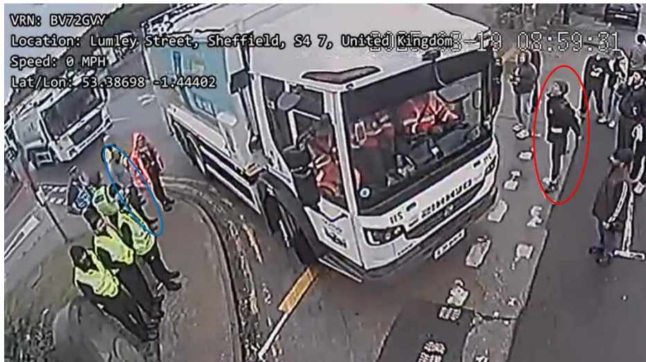
Image 10: Screenshot from Rear RCV Footage on 19 August 2025 at 08:59:31.